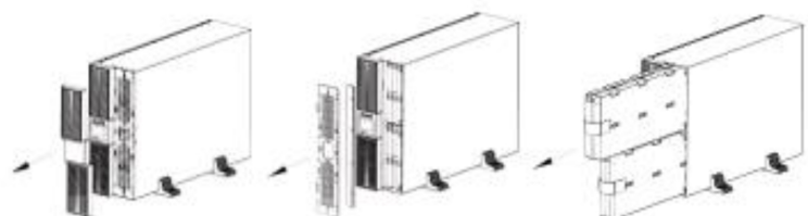
Easy for maintenance, hot-swappable battery