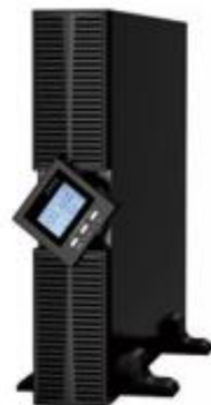
Display panel can be rotated